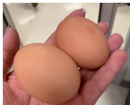
Our first eggs!